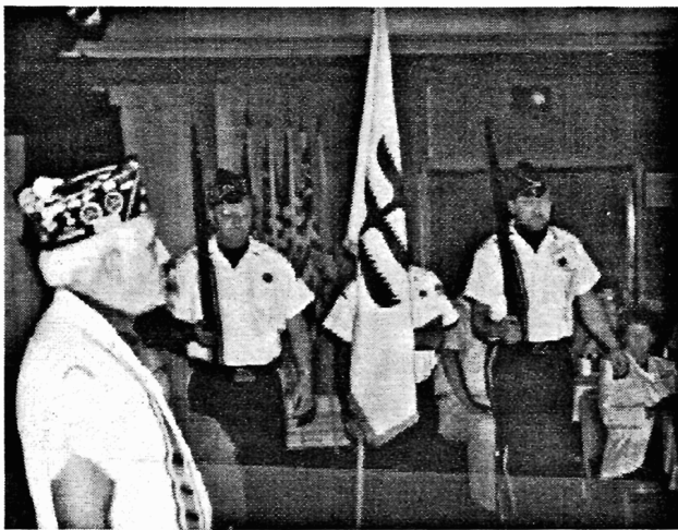
Joint Flag Day Ceremony with Laurel Elks, 1977